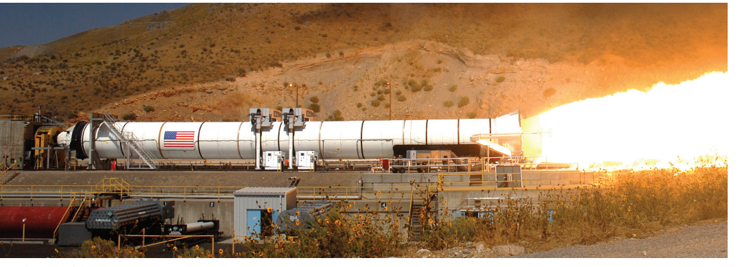
Static Test Firing at Promontory, Utah