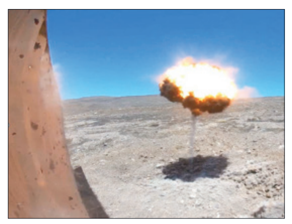
2 m Height of Burst