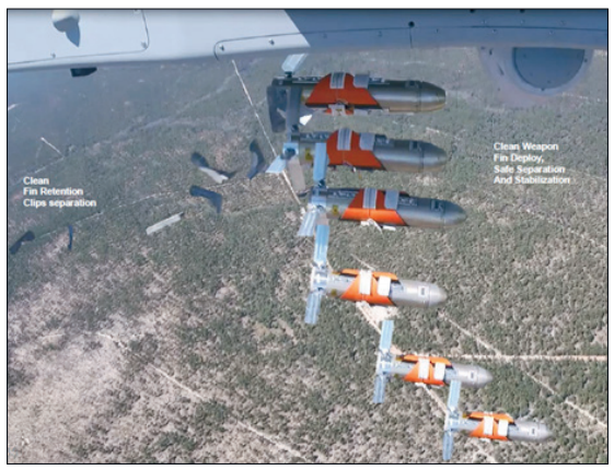
Release from a DoD Group 3 UAS (April 2022)