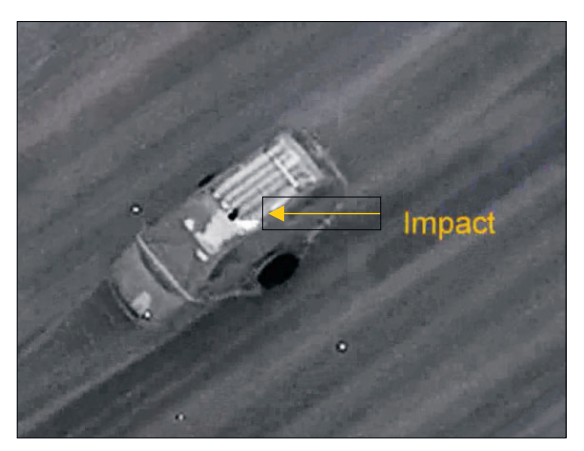
50 mph Moving Vehicle <.5m accuracy (May 2021)