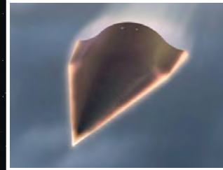
Detect & track hypersonic glide vehicles