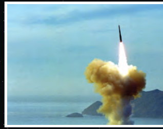
Detect & track all-range missiles