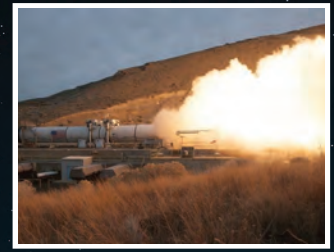
Monitor static tests