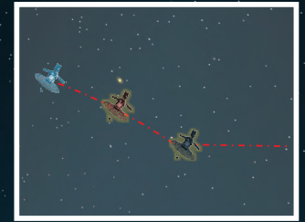
Detect & track satellite launches, maneuvering, & re-entry