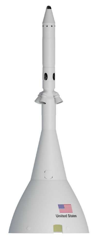
Launch Abort System

Orion will serve as the exploration vehicle that will carry the crew to space, provide emergency abort capability, sustain astronauts during their missions and provide safe re-entry from deep space return velocities. Orion missions will launch from NASA's modernized spaceport at Kennedy Space Center in Florida on the agency's new, powerful heavy-lift rocket, the Space Launch System. On the first integrated mission, Artemis I, an uncrewed Orion will venture thousands of miles beyond the Moon over the course of about three weeks. The mission will pave the way for a series of missions that will take humans to deep space, and eventually to Mars.