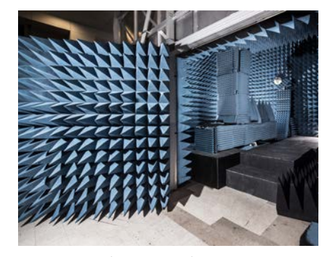
Spherical Near-Field Range