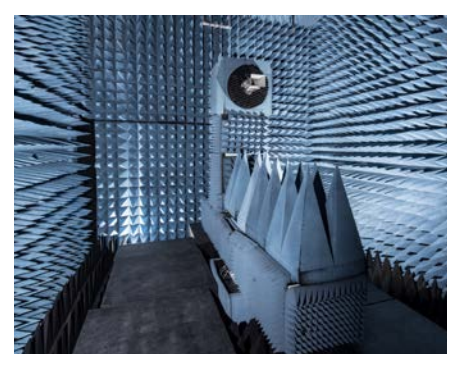
Spherical Near-Field Range